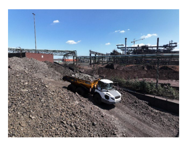
liebherr-earth-moving-machinery-report-heis-germany.jpg A TA 230 dump truck transports cooled slag from DK and piles it up.