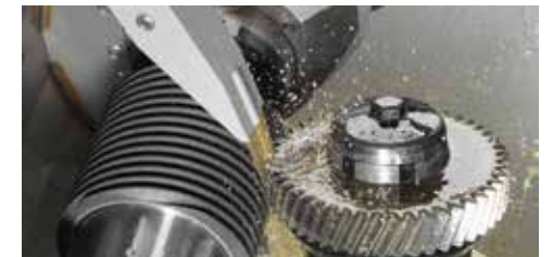
Machine tools and automation systems