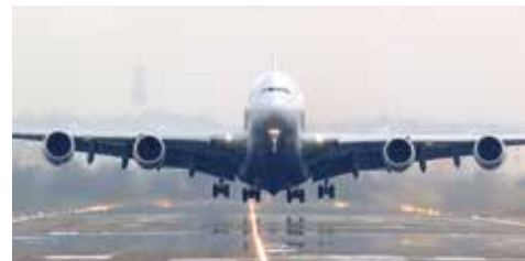
Aerospace and transportation systems