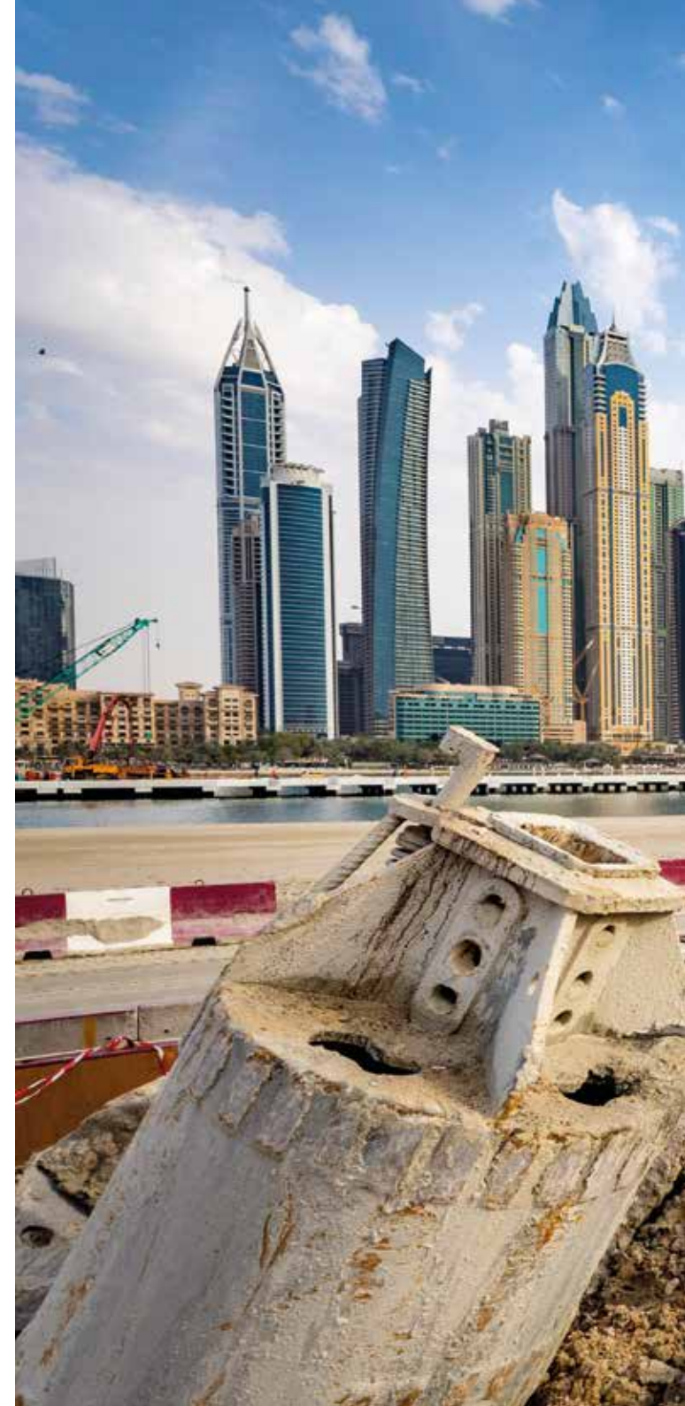
Rotary drilling rig LB 36 installing piles in Dubai

The rotary drilling rigs of the LB series can be used for all common drilling methods. These include Kelly drilling, continuous flight auger drilling, double rotary drilling and full displacement drilling.